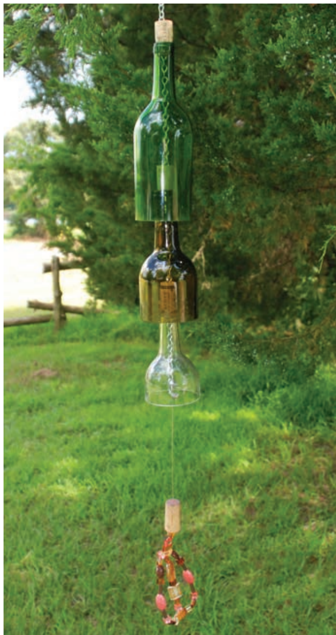
ABOVE: Burns says her wind chimes are more durable than they look. BELOW: In Burns' hands, a paper party napkin finds a permanent life as an artistic detail on a vanity.

Sometimes Burns needs a break from painting or upholstering furniture to let her joints rest, but she doesn't sit still. She crochets various art objects such as decorative pumpkins or functional coat hangers with clips that rest at various heights for hanging multiple small laundry items such as socks or delicates for drying. Departing from fabric, yarn and wood, she'll break